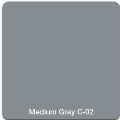
Medium Gray C-02

Custom colors upon request, actual colors may vary.