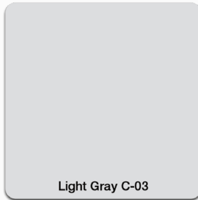
Light Gray C-03